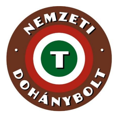
The logo of traffics