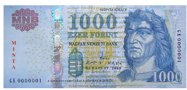
1000 FT ~ 3 EUR